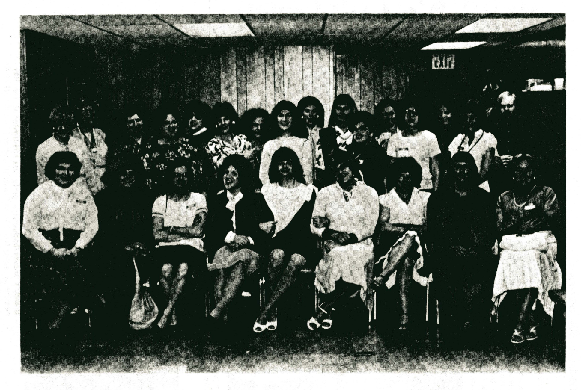
CHI DELTA MU Chapter Meeting, May 1985