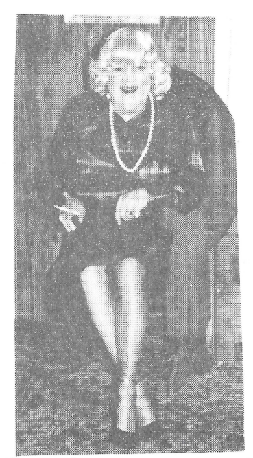
Dee Dee 2-CT-061