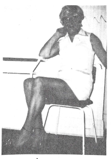
Marlaine 102 PQ-H3A