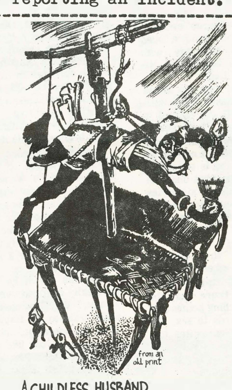
A CHILDLESS HUSBAND OF THE BHIL TRIBE OF INDIA BELIEVES HE CAN ASSURE PROGENY BY SWINGING FROM A HIGH HOOK WHILE ATTIRED IN WOMEN'S CLOTHING