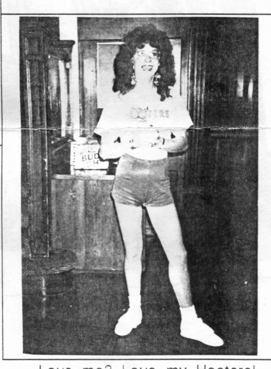
Love me? Love my Hooters!