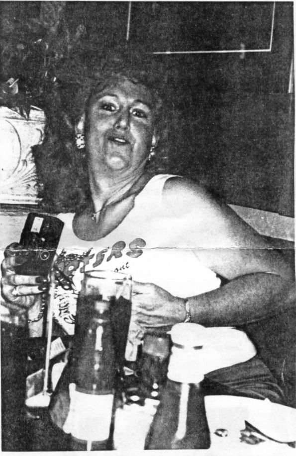
Flirtin' With Disaster!