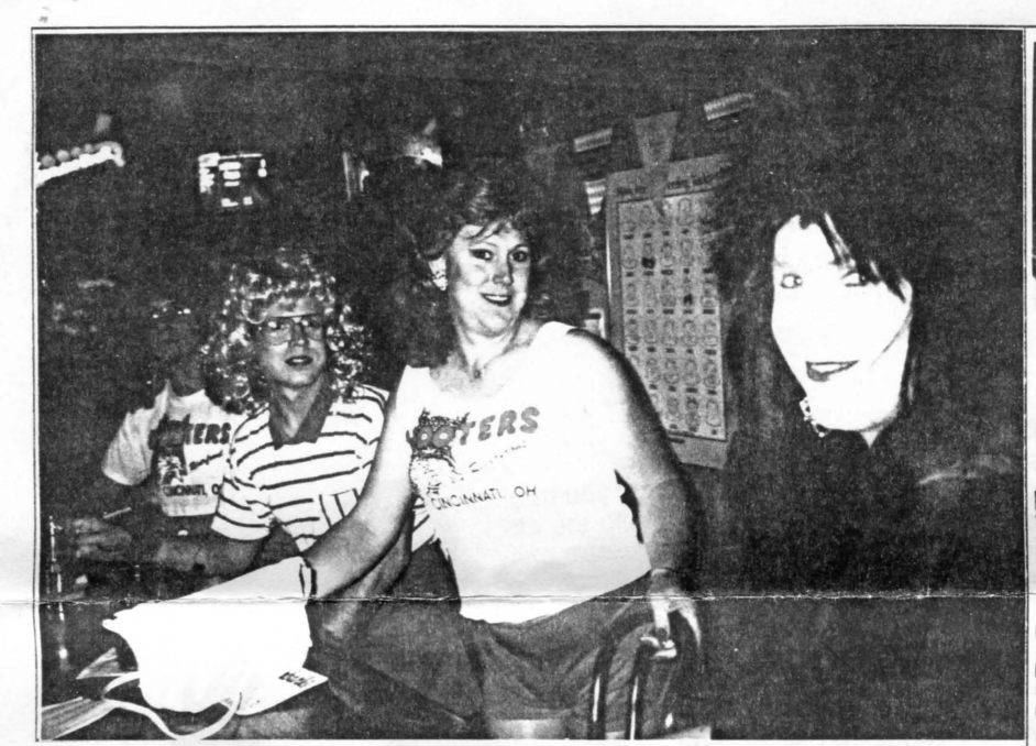
The "B" Girls