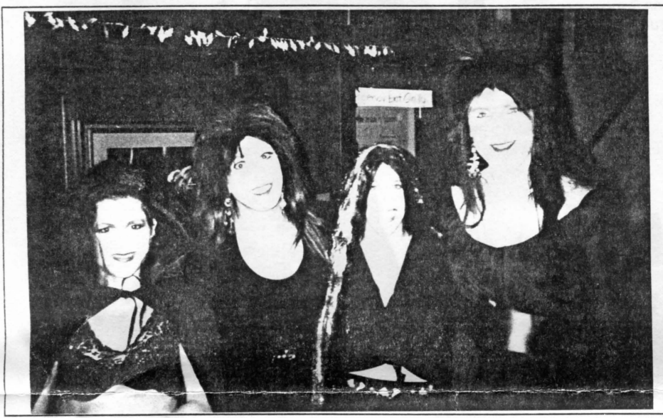
Elvira Meets Vampira X 2