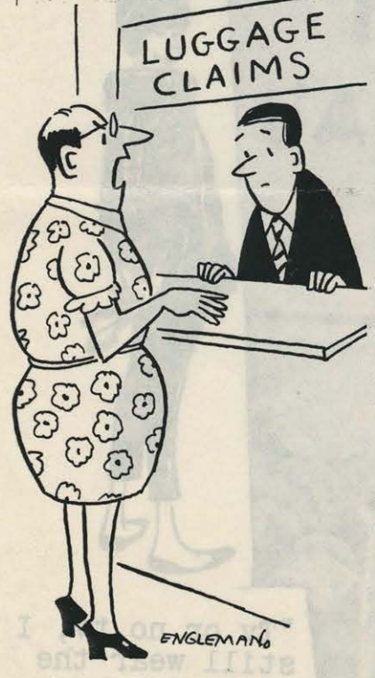
"So far all we've received is n wife's luggage!"