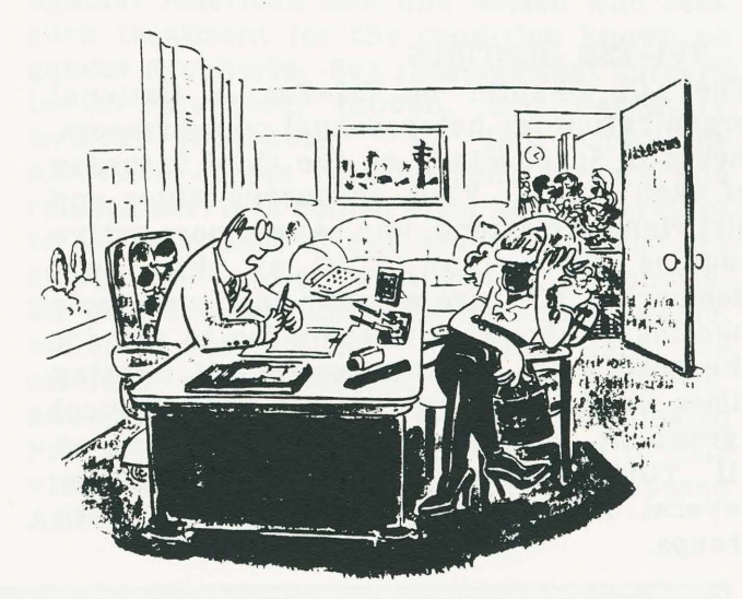
"I told you we were an equal-opportunity employer. I didn't say we were fucking crazy!"