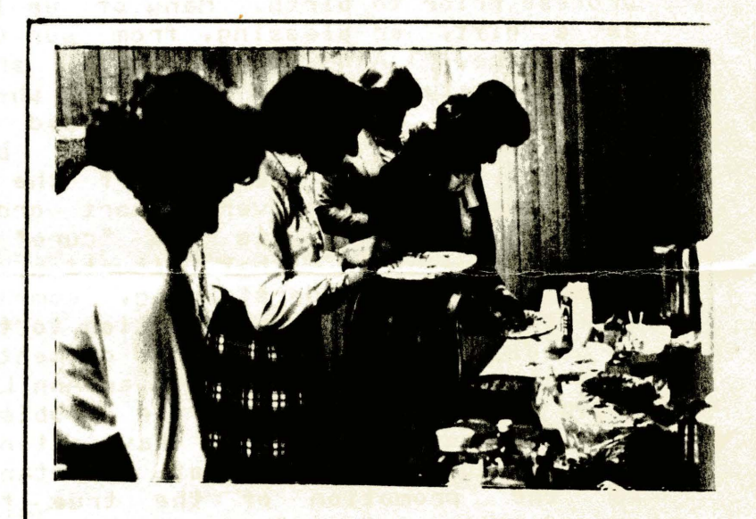
Ladies helping themselves to some dinner. Come on, girls, go easy if you want to participate in next Fall's Lingerie Party!