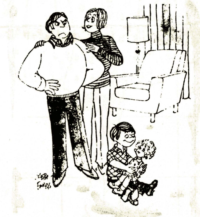
"Just keep saying to yourself. 'I'm not a sexist, I'm not a sexist' . . . "