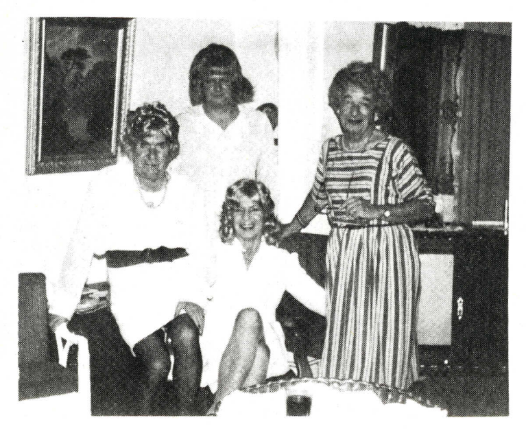
THE DURBAN GIRLS HAVING FUN.