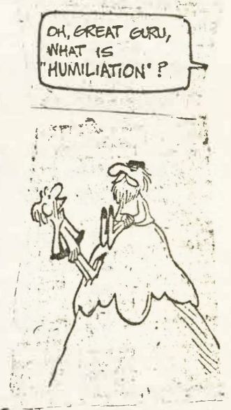
HUMILIATION" IS SHOVING UP AT A BALL DRESSED IN THE SAME GOWN AS A 68-YR - OLD TRANSVESTITE.

because transvestites aren't interested in changing. The best you can expect is that he will agree not to appear in drag in your presence if you ask him not to.