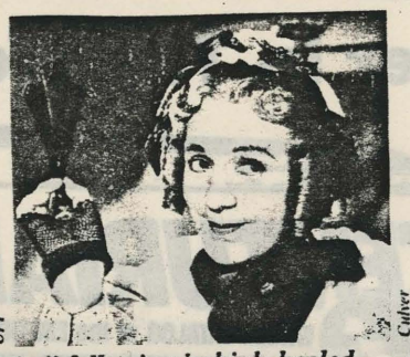
Dustin Hoffman in "Tootsie," following in high-heeled footsteps of Curtis and Lemmon (top) and Jack Benny

Actors A stock ingredient of costume comedy is the "male in drag," a In Drag quintessential masculine star wearing women's clothing and too much makeup.