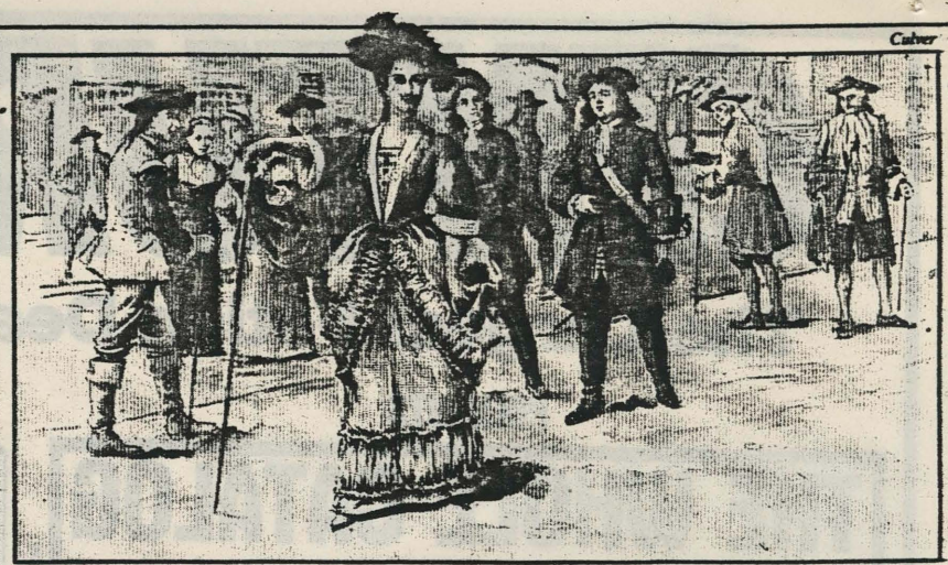
Lord Cornbury flaunts his finery before unappreciative New Yorkers