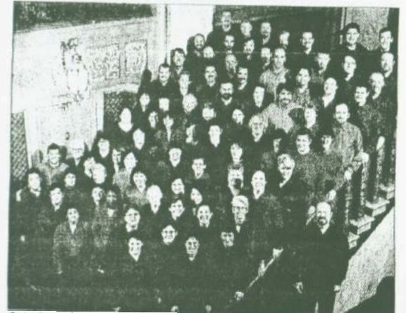
S attle Lesbian and Cau Chorus numbers at the Paramount Theatre in 1996.