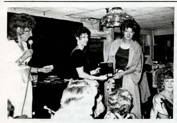
Miss Cinderella receives her award

The evening ended with a house party at Chicago house which lasted till the wee hours. This was a time when all those in the house really let down their hair and opened up. All realized that tomorrow it was back to the home situation and an end to a true fantasy, at least till next year.