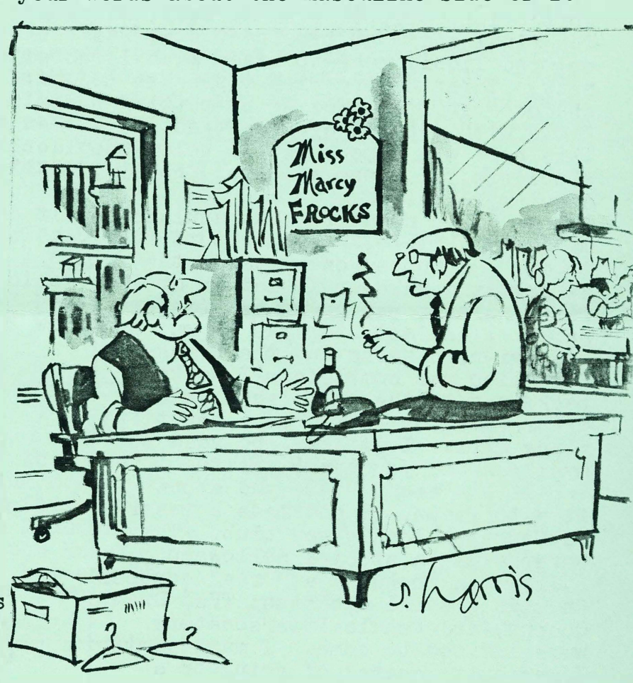
"Organdy party dresses at home, little black evening dresses at the office—as a transvestite, my son is a joke.'