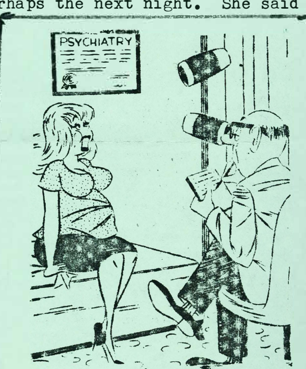
"It all started when I slipped on my wife's maternity dress.