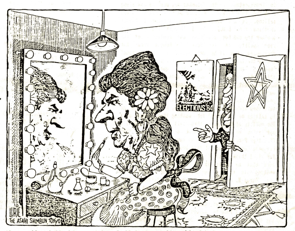
'Our president, in his ultimate wisdom, decided to correct his anti-feminist image.'