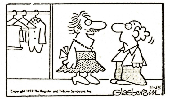
"If an earring and a necklace can make a man look macho, just think what a whole outfit can do!"