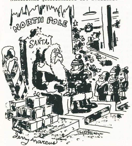
'No. I haven't been a good little boy, but I have been a good little girl

at the club, please write or pick one up if you haven't already joined in this project - JW)