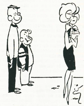
"AND TO THINK YOU AND I ONGS PLAYED FOOTBALL WITH HIM. "

females: in other words, the sex of your child would be made to order.