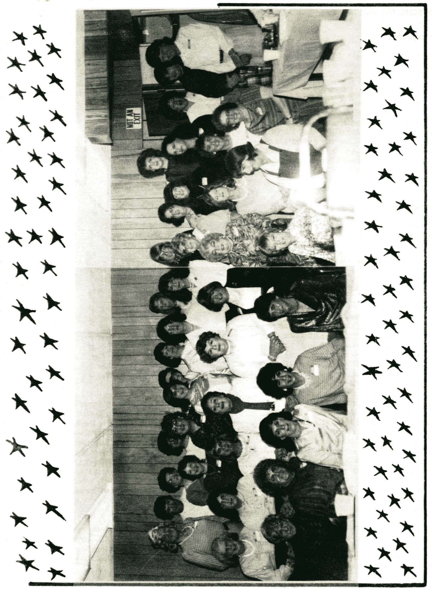
A T T C C CHAPTER MEETING, 7 41 110 HIU