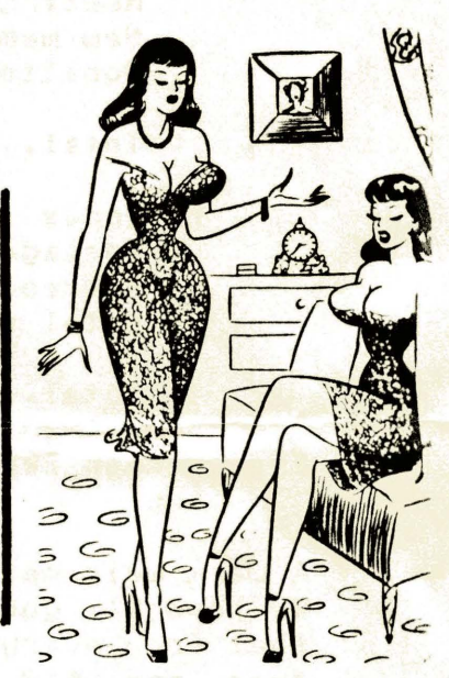
"All this practice! And Walki And Sitting! Remember when it was just panties, Walt?"