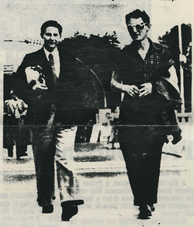
On vacation, it was hard to tell husband from wife (left)