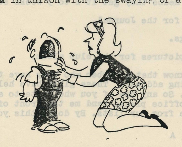
"That's the third TV-beard-plucking case this week."

There are also purely mental TVs. These dom't care about dressing. In some instances, they have dressed a few times, but their esthetic sense tells them they'll never make it. They are extremely sensitive about beauty and the image in the mirror is unconvincing, not satisfying. So they abstain, some find relief in day dreaming, others in the company of TVs, others in TV literature. They show up at masquerade balls in their regular street clothes and by a process of mental transference they experience the theills of those who are dressed up. they love to collect TV pictures and clippings. Age and overweight are sometimes the reasons behind this absence of active TVism. Outwardly they seem to have definitely abondoned the ranks of TVs but their minds and hearts are still beatinging in unison with the swaying of a skirt and the click, click of high heels.