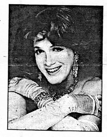
'IN THE LIFE' Drag artist Charles Busch as a film legend

Two shows are being syndicated to public TV stations (check local schedules), including the fourth-season premiere of gay newsmag In the Life . Eclectic and earnest, it includes a report from Beijing's women's conference and a fea-