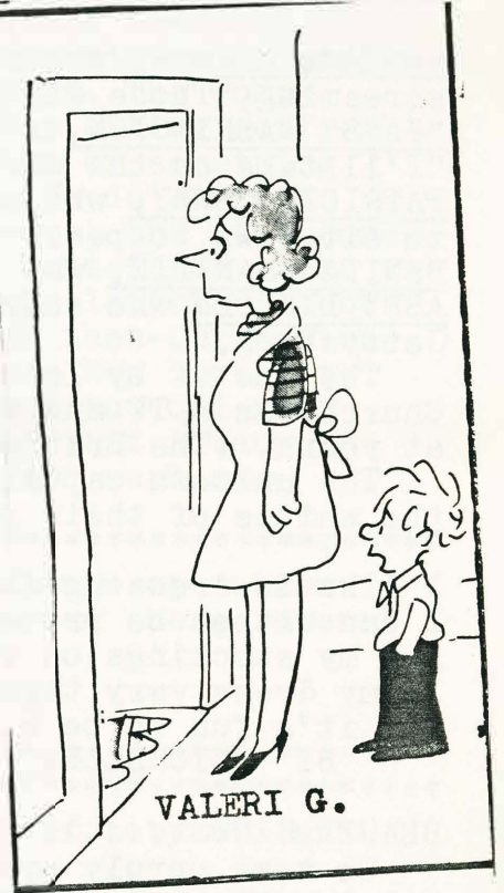
"Mom's not going to like the mess you made in there while you were getting 'en femme', pop!

mination: *The importance that I place-in spite of all my beliefs, better judgment, rationalization-on appearances and good looks, on using looks as a way of gaining accept-ance and recognition and love (in fact as the primary way of doing this-being an ornament, putting myself up on a shelf, on display, and waiting for someone to come along to pick me and take me home and take care of me) *My love of woman's body as a form, as a thing of beauty, that I want to possess or at least have available when I want to look at it-My desire to not possess-own any nerson just as I don't want to be owned or responsed by person, just as I don't want to be owned or possessed by (continue on page 6) anybody;