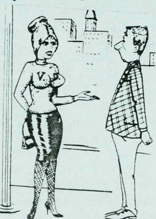
"Of course not, Silly! They're my initials."