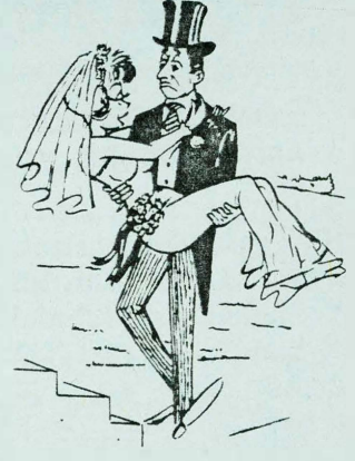
"Careful, Charlie, I don't want to have a miscarriage."