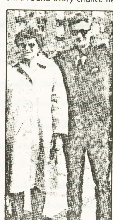
Members of the club nightclub for dancing under include a number of married couples

She then recounted a story about a famous Hollywood actor who came to CHANGERS every chance he