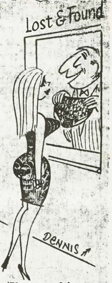
"You can reclaim these tonight at 371 Pine Street, apartment 7."