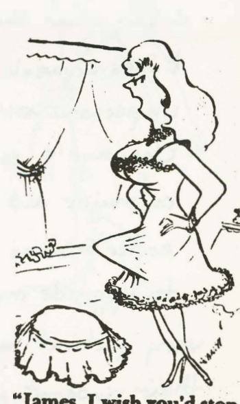
"James, I wish you'd stop borrowing my underwear!"

There is only one thing a man can do that a woman can't—go topless at the beach without getting arrested.