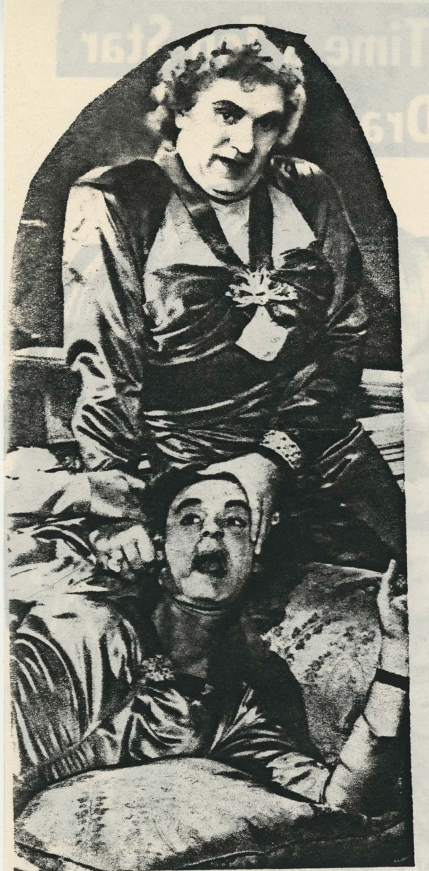
DENNIS O'KEEFE and WILLIAM BENDIX (standing) got all dolled up for the 1944 movie "Abroad With Two Yanks."