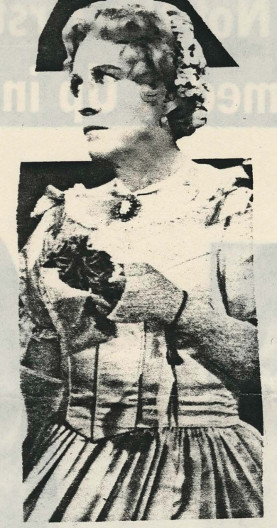
BING CROSBY was a Southern belle in 1960 for "High Time."