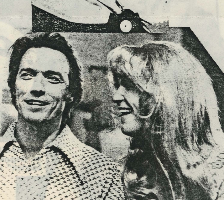
JEFF BRIDGES went in drag when he and Clint Eastwood starred in "Thunderbolt and Lightfoot" in 1974.