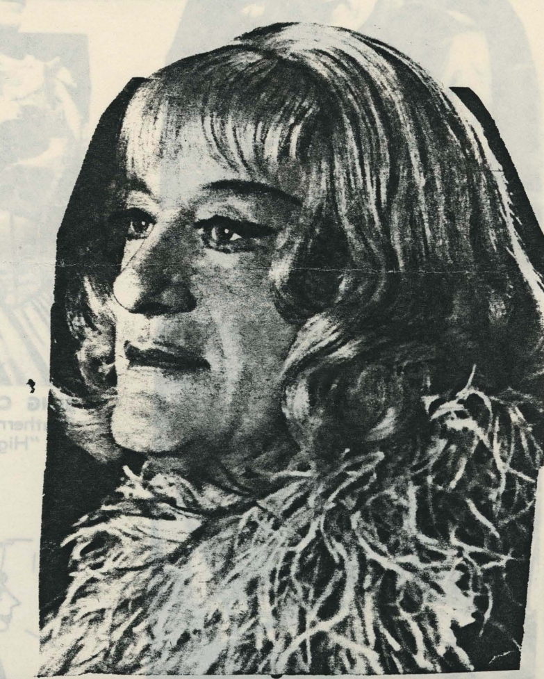
GEORGE SANDERS portrayed a female impersonator in the film "The Kremlin Letter" in 1970.