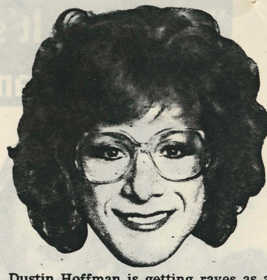
Dustin Hoffman is getting raves as a man who dresses as a woman in the hit movie "Tootsie" (above). But Hoffman's only the latest in a long line of actors and actresses who faced the cameras wearing garb of the opposite sex, as these hilarious photos show.