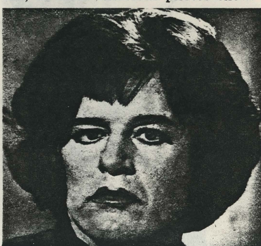
ROD STEIGER dressed in drag for "No Way to Treat a Lady" in 1968.