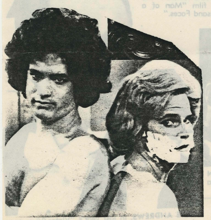
TOM HANKS and PETER SCOLARI, in the 1980 TV series "Bosom Buddies," pretended they were women so they could live in a low-rent all-female hotel.