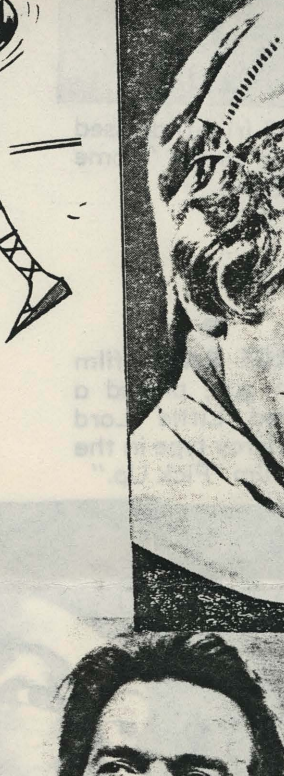
Hidden behind a per cap, blonde wig a old-style glasses — the role of a Germ cloakroom attenda — is one of screer most virile Europe stars. The swashbuc ling hero of actifilms, Curt Jurge couldn't resist the of beat role in a Munic television play.