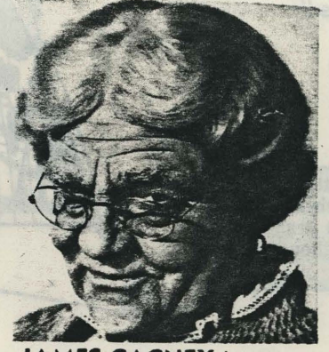
JAMES CAGNEY impersonated a female in the 1957 film "Man of a Thousand Faces."