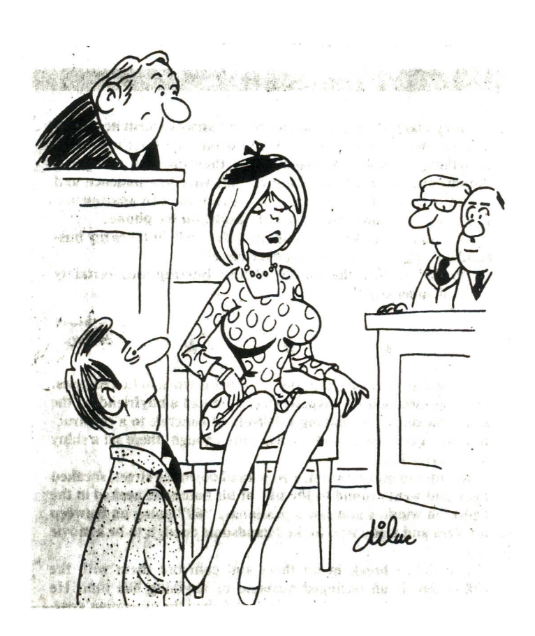
"Well, Your Honour, I want a divorce because my wife objects to the way I dress!"