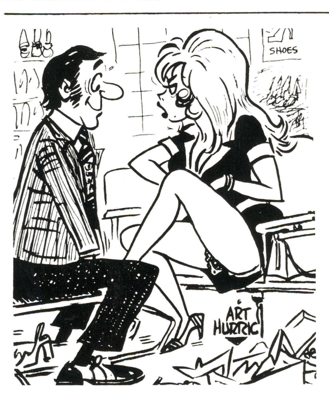
"Ok! So I'm a transgenderist. Now stop staring at my essentials and get on with the fitting!"

In the case of Fanfare and Phoenix publications I predict that the books now being produced will, in a short space of time, become greatly treasured and valuable collector's items.