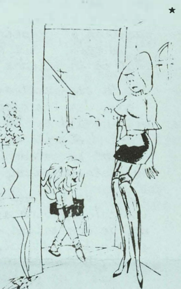
IVE HAD A FEW HANGUPS SINCE CHILDHOOD !