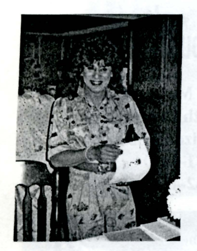
Some Photos Of Our Girls