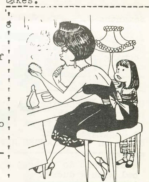
. HURRY DADY, MOMY WANT'S 'HER LIPSTICK BACK.